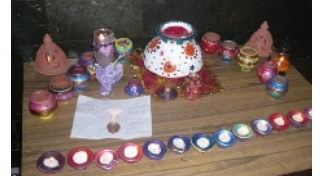
Pots and diyas decorated by children

During the month of October along with the stories of nine swaroopas of Devi, the children coloured and decorated small pots. Diwali was exclusively celebrated at our center where the parents were invited to see the exhibits of their children. We had a small Diwali party, during which a story about the importance of lights was told. We completed sessions related to Attitude towards food, where the importance of Healthy food was highlighted. Here we brought out the importance of grains and pulses through Power Point presentations which children viewed in awe. Also we had Vimarsha on topics related to Contentment v/s Motivation, which were introduced through stories based on Shivaji's life history. Children also shared about their experiences.