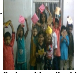
Posing with smiley kites